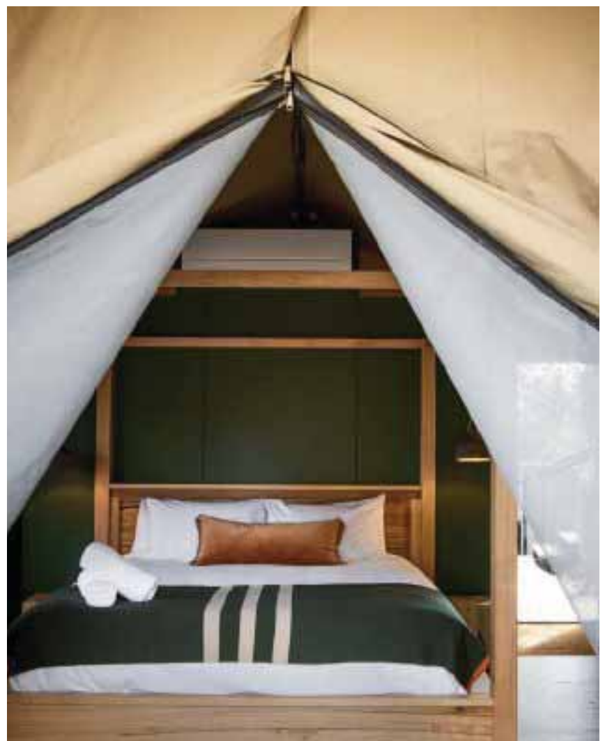
BARRELL OF BATHS Above: Bathing barrels and mineral pools at the adults-only hilltop escarpment at Metung Hot Springs. Below: One of Metung's glamping tents.

On my visit, the first stage of Metung Hot Springs is nearly complete. Ten glamping pavilions, thermal bathing pools, sauna, plunge pool, day lounges and walking trails are dotted around a freshwater lagoon. A reflexology walk through shallow water gently massages my feet before I drop my robe and slink into the ecliptic baths set in the hillside. Rugged banksias curve over and around the pools, adding to the feeling of seclusion and discovery. The pools are chlorine-free and the earthy mineral scent amplifies the connection to the ancient aquifer below. Trace elements such as boron, magnesium, potassium, sodium and calcium in the water work like a wellness cocktail for my skin, which feels instantly softer and smoother.